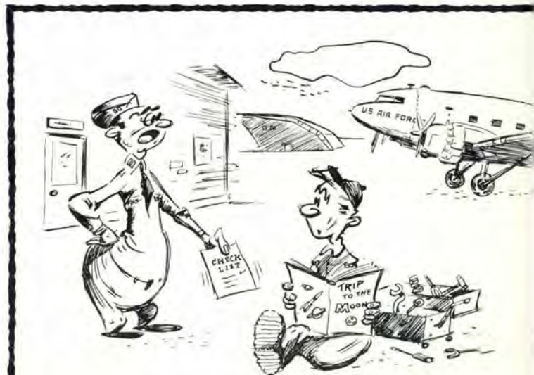
"We may be flying space ships in the future . . . But right now I'm concerned with how safe is that Gooney Bird for flight!"