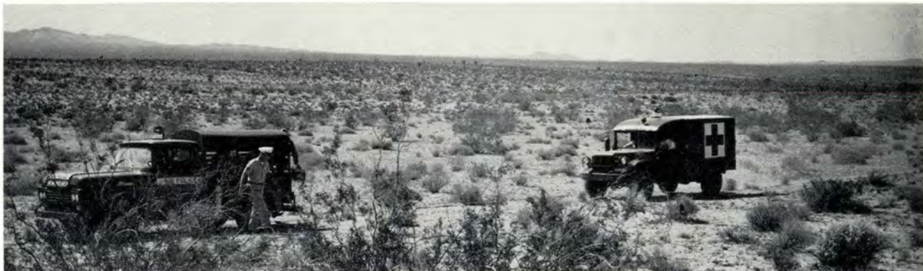
Ambulance and Air Police vehicle have arrived at crash scene. The APs guard wreckage area while ambulance backs up helicopter evacuation.